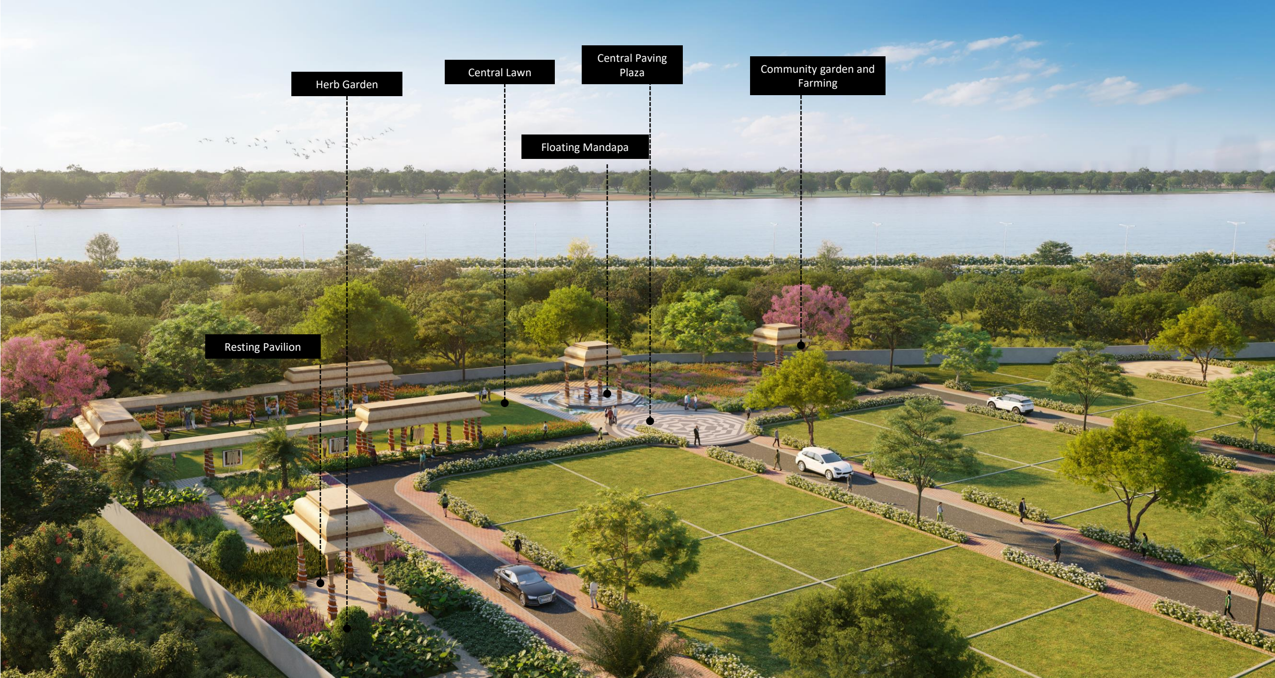
Spaces created to foster community engagement & sustainable living with farm to table concept