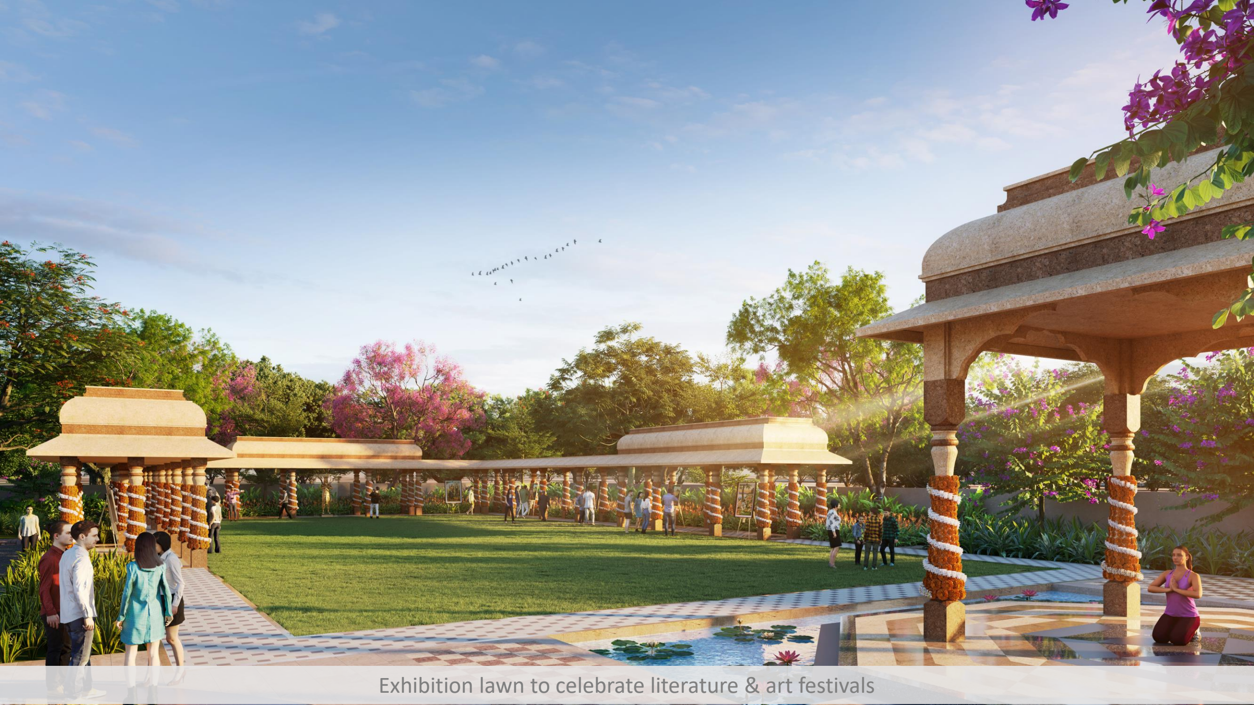
Exhibition lawn to celebrate literature & art festivals